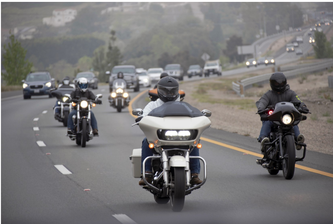
Sailors assigned to the amphibious assault ship USS Tripoli (LHA 7) participate in a command motorcycle ride, April 28, 2023.